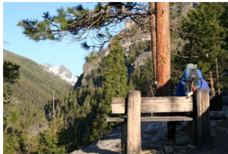
Picture yourself here... Blodgett Canyon, Western Montana

Make this convention a family event! The Western Montana Fair should be in full swing as well as Missoula's baseball team, the Osprey. Missoula has two public pools and a third, Splash, with slides. Mountain biking, walking, and hiking spots are less than 15 minutes away from the city